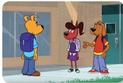
Not Cool, Kyle (for grades 2-6) Kyle learns why it is never cool to bring a gun to school.

Both videos are available free of charge on the McGruff's 4 Steps of Gun Safety page at the National Crime Prevention Council website: ncpc.org/McGruffGunSafety .