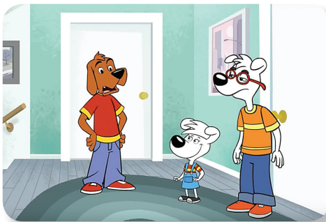
Molly's Mischief (for grades K-2) Molly learns what to do when she finds a gun in her parents' bedroom.

Your child has learned to follow these four steps and why they are important for safety. We hope you will reinforce this lesson by viewing McGruff's gun safety videos with your child.